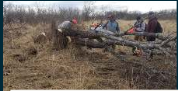
2020 Moose habitat enhancement crew.

Amidst the pandemic, gravel & rock sales have continued. The Snake Lake rock quarry and 9.5-mile pit were busy with contractors hauling gravel and rock for various projects around Dillingham. Activity at the 9.5-mile pit have been ongoing throughout October.