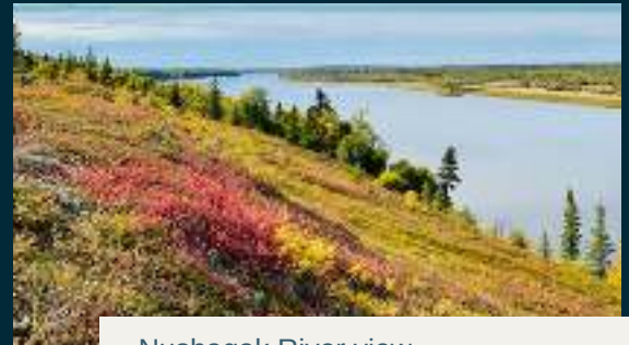
Nushagak River view.