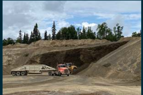
9.5 Mile pit activity.