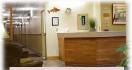
The Bristol Inn entrance renovations.

To keep in line with Choggiung's 5-year objective to be "best in class" in real estate we've been working hard to improve the function and appearance of our properties by replacing equipment, boilers, roofs, and upgrading floors in our commercial and residential buildings. There is a