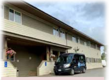
The Bristol Inn's new courtesy van.

1 lot more work to be done and we're happy to see the progress so far.