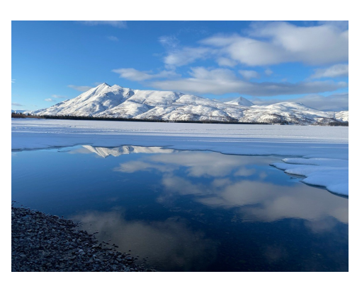
Cover Photo of Snake Lake by April Roehl