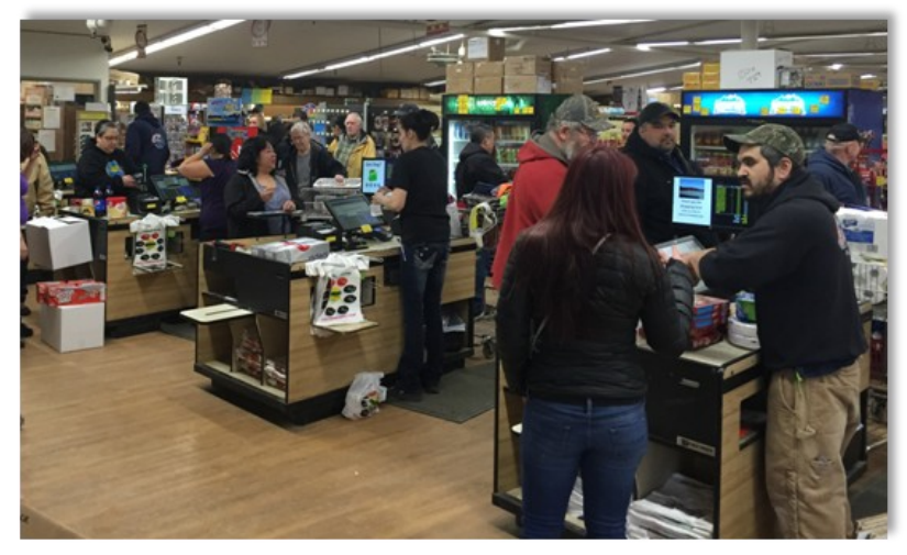
Dillingham shoppers taking advantage of the liquidation sale held by Omni.

For details on the Choggiung Heating Fuel Reward Program email Vitus at customerservice@vitusmarine.com.