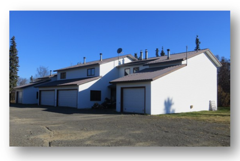
Raspberry Flats, a fourplex apartment building in Dillingham, was purchased by Choggiung Investment Corporation.

The purchase was made using the HUD 184 program which allows the buyer to purchase a single family home up to a fourplex, with 2.25% down, no mortgage insurance, and 3.87% interest rate.